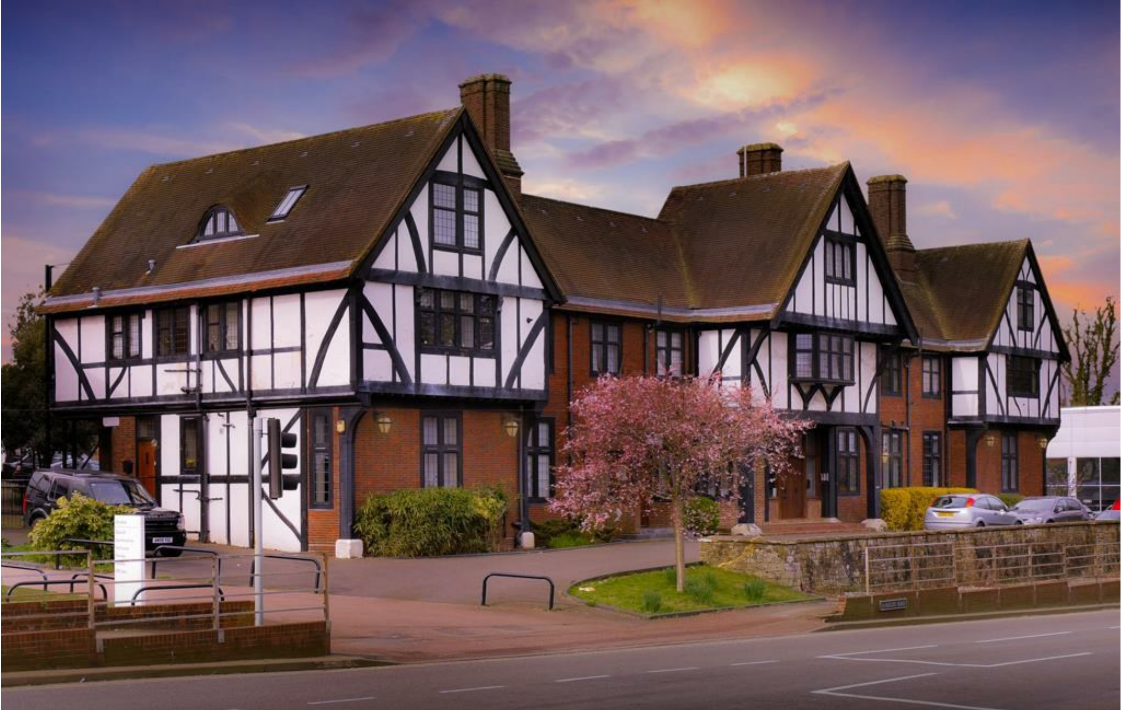
The Driftbridge, Epsom